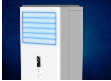
Totally Enclosed Air Outlet Blades Design