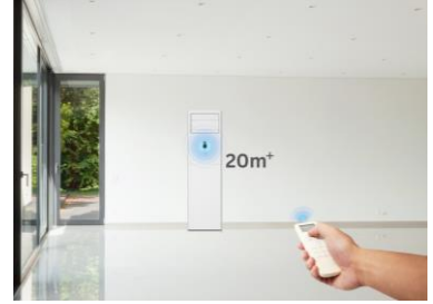
Ultra Long-distance Remote Control